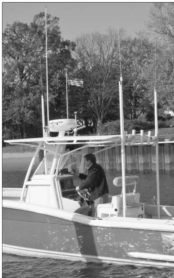
Above: In this real-world test, we took the antennas offshore to determine their maximum range.

We installed each 8-foot antenna on the oversized T-top of the test boat, a 26-foot Scout center console with twin F150 Yamahas.